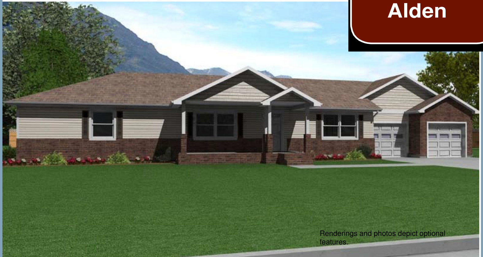
Renderings and photos depict optional features.

Total Square Feet 1,547 | Bedrooms 3 | Baths 2 | Building Footprint 56' x 28' | M EG 2856 3 2 SB (B) STD